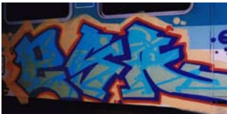
90's special p. 4-15