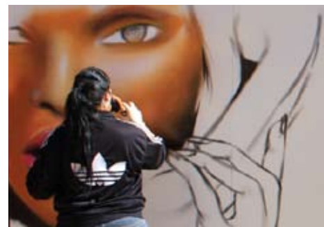
Womensday Jam p. 22

Fancie interview p. 12 Trainwriting is at a peak in Europe in the early nineties. Women are also up in this game, regardless of the dangers that are involved (Lady Clyde (RIP)). One of the most notorious European trainwriting crews are WUFC and SDK and on their team is Fancie.