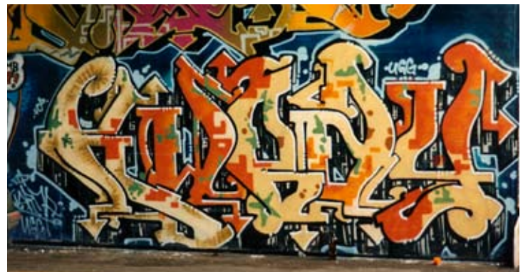
Planet Rock by Spice [AUS]- Spice [AUS] Spice [AUS] - Children are our future by Spice '94 [AUS] Spice '97 [AUS] - Femme9 '98 [US] Spice '98 [AUS] - Karma '95