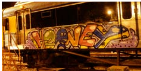
Steel p. 24