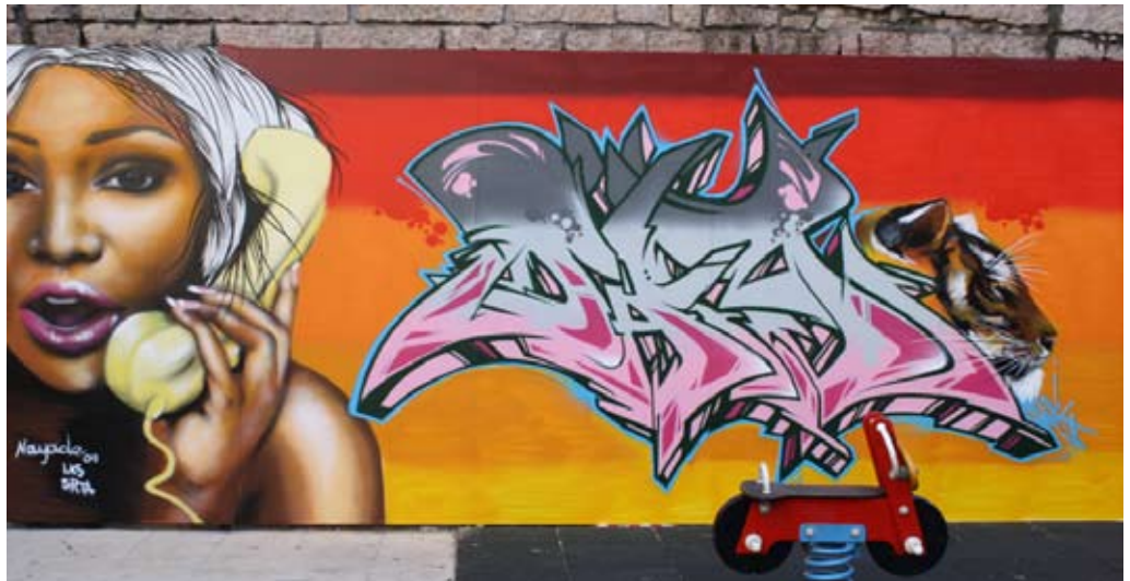
Womensday Jam, Vigo 2009 Nayade - Sax