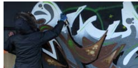
Hall of Fame p. 20