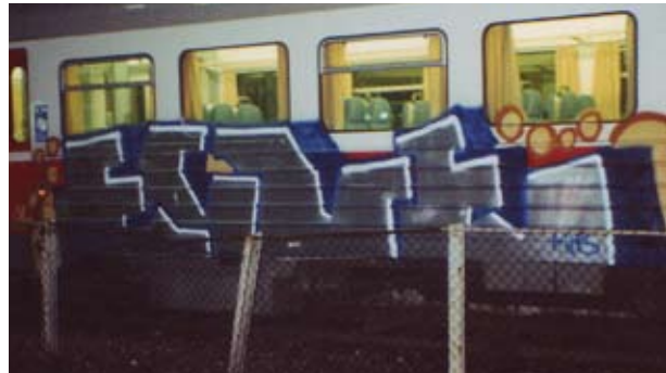
Elle '98 Devo '95 [DK] - Gin '97 [DK] Lenie '98 [FR] - Elle [CH] Fancie '98 [FR]