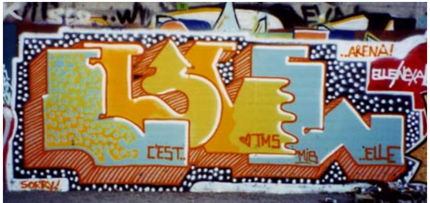
Mickey '93 [NYC] - Arena in action Arena [CH] - Sue [CH] Shay by Karma '96 [CH] - Elle [CH]