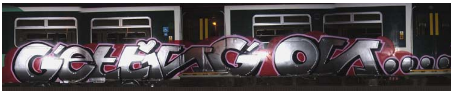
Puff [DE] - H2oney [DE] H2oney [DE] - Else [FR] Getting On.... Trains crew [JP]