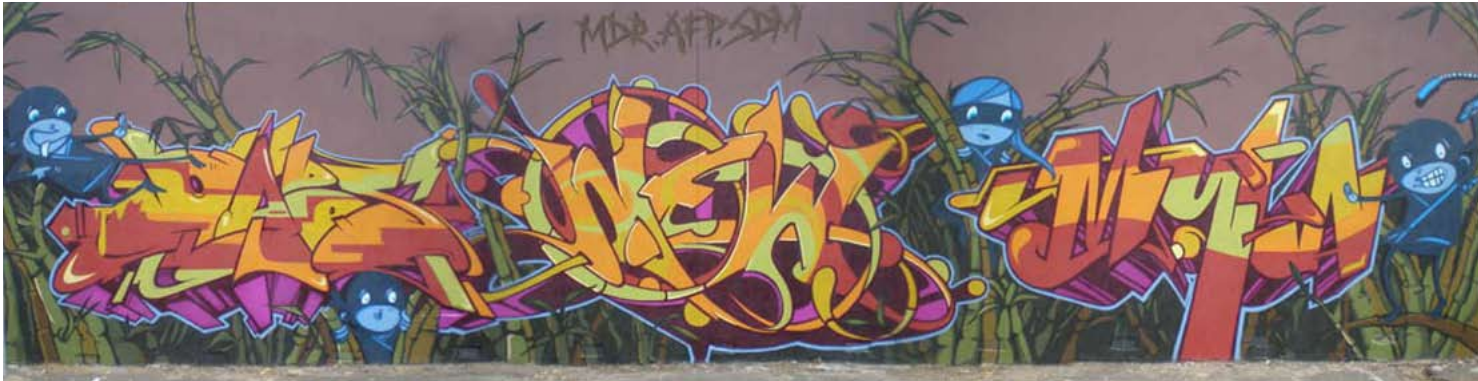
Myla & Deb Melbourne, Australia